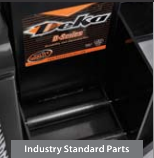
Industry Standard Parts