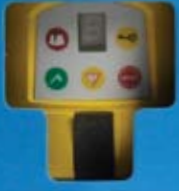
Industry Rated Safety System